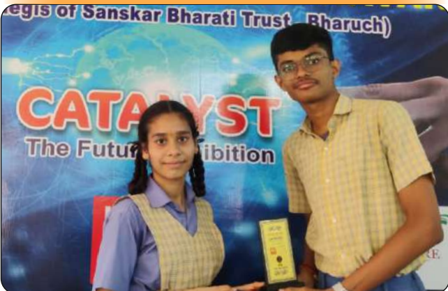
Second Prize Winners