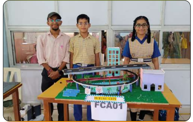
First Prize Winners