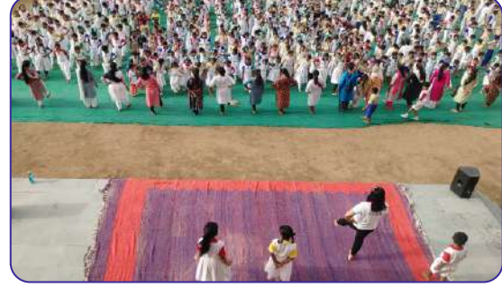
YOGA DAY CELEBRATION