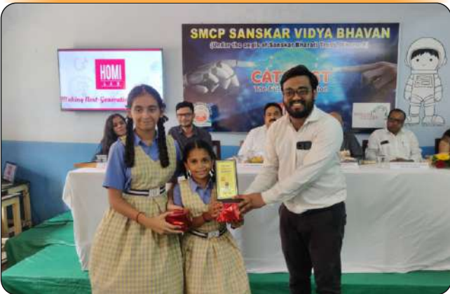
First Prize Winners