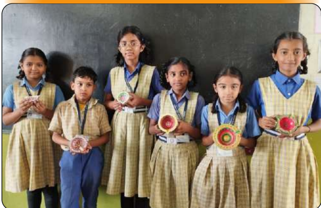
DIYA DECORATION COMPETITION