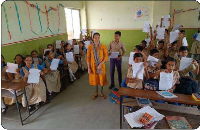
KARGIL VIJAY DIVAS