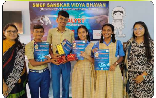
Second Prize Winners