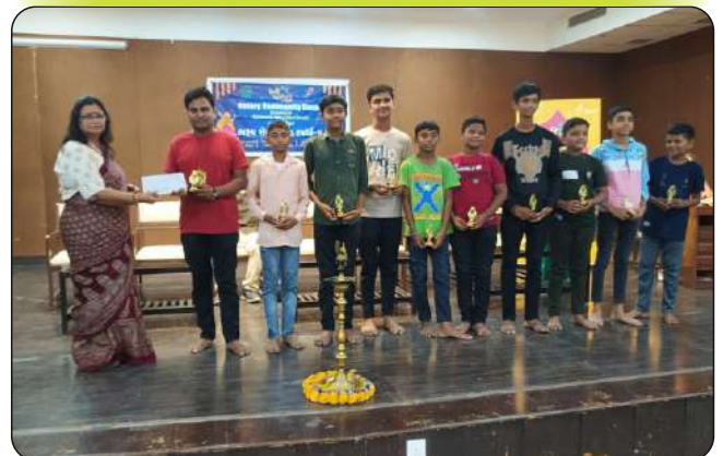
Third Prize Winners