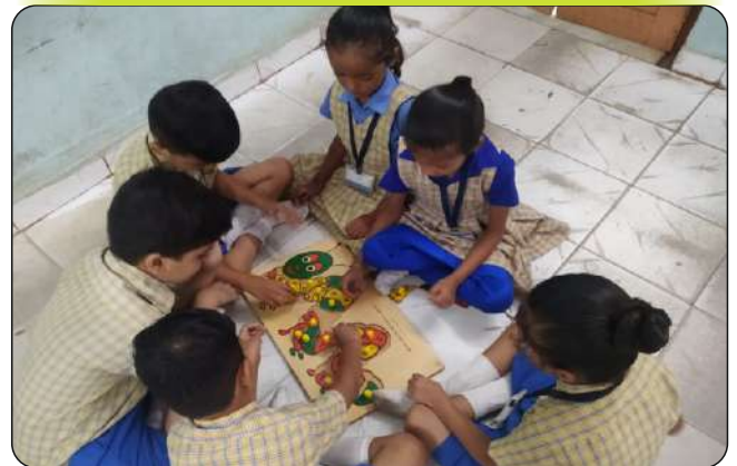
ART AND CRAFT ACTIVITIES