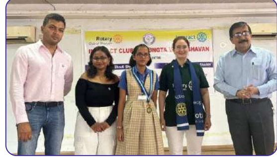
INTERACT CLUB INSTALLATION