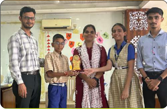
First Prize Winners